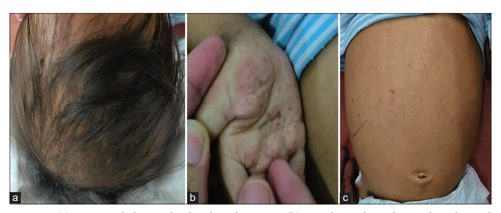
Figure 1: (a) Sparse scalp hair with seborrheic dermatitis, (b) Maculopapular rash over the palm, and (c) Maculopapular rash over the abdomen.

How to cite this article: Chhazed SN, Thakkar C, Kulkarni S. A rare presentation of langerhans cell histiocytosis with cholangitis. Wadia J Women Child Health 2023;2(1):48-9.