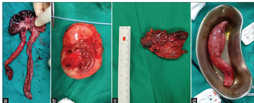
Figure 1: Faulty photography of surgical specimens – (a) dirty background, specimen held with fingers, (b) infant feeding tube used instead of scale, (c) scale not seen completely, and (d) specimen in kidney tray with numerous peripheral distractions.

A surgical specimen must be oriented in an anatomically appropriate position and photographed using appropriate lighting and dimensionality. It should be devoid of shadows and other peripheral distractions. The background surface should be neutral and wiped clean of blood, bile, or ink. The specimen surface should be cleaned by rinsing under running water. Any ink or tissue fragments should be wiped off. Instead of using hands or fingers on in the photograph, hemostats, probes, or forceps should be used to hold or demonstrate a region of interest [Figure 1]. A clean