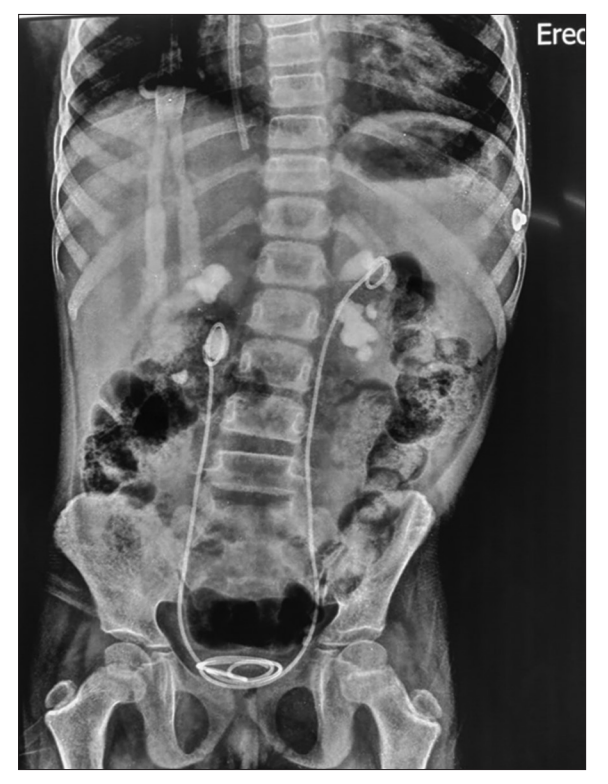
Figure 2: Multiple stones in the urinary tract with bilateral DJ stent in situ .

abdomen [Figure 2] and renal sonography revealed bilateral gross hydronephrosis with multiple mobile calculi within both renal pelvis, bilatreral echogenic kidneys with loss of CMD, right ureteric calculi 1 cm, left upper and mid ureter multiple calculi. There was a strong family history of kidney stones in first degree relatives. Twenty four hour urinary calcium was 2.4 mg/kg/day (normal - <4 mg/kg/day), 24 h urinary oxalate was raised at 75mg/1.73m2/day (normal- <45 mg/1.73 m²/day). Child underwent left pyelolithotomy with urterolithotomy and 18 calculi were removed. Stone analysis was suggestive of calcium ammonium oxalate stones. Urine output got established after procedure and creatinine started decreasing. Child did not require further haemodialysis and was discharged with serum creatinine of 1.1 mg/dl on tablet vitamin B6, capsule oxalobacter formigenes . Child