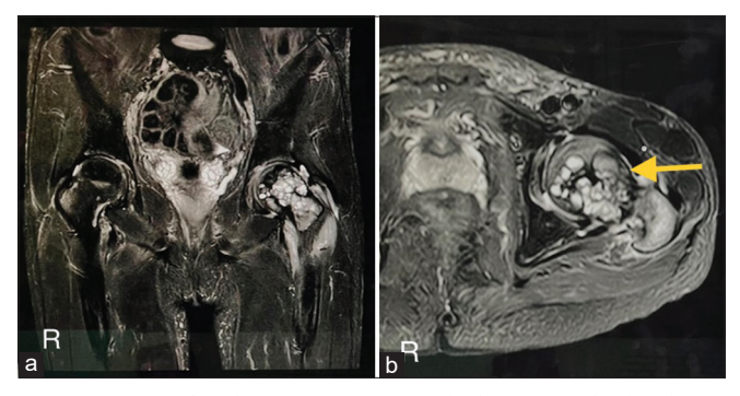
Figure 2: (a) Diffuse hypointense T1 signal of marrow of pelvic bones and hyperintense T1 short tau inversion recovery (STIR). Multiple well defined cystic areas in the left lesser trochanter, roof of left acetabulum, right superior pubic ramus and in anterior inferior iliac spine on right side. Largest lesion is seen in the head and neck of left femur. These findings are suggestive of brown tumor with changes of renal osteodystrophy. (b) shows well defined lobulated expansile lesion with internal septations seen more prominently in the head and neck region (yellow arrow). Internal septations: thickening seen within lesions, suggesting non enhancing lines within the lesion.