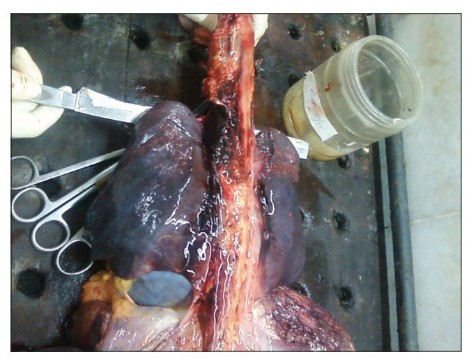
Figure 2: Aortic dissection on post-mortem of sudden maternal collapse.

there is no breathing, chest compressions and ventilation should be commenced immediately.<sup>[3]</sup>