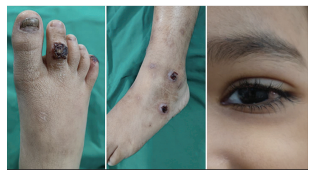
Figure 1: Skin and ocular lesions in our patient with Shabbir syndrome.

systemic examination and blood work-up were unremarkable. She had a few crusted skin lesions over her elbows, toes, ankle, and knees, which were thought to be insignificant at the time of initial evaluation [Figure 1]. Requisite consents were taken, intravenous (IV) access was secured in the ward and she was shifted to the operating room after adequate fasting. In the operation theater, standard monitors were applied, and vitals were recorded. Baseline oxygen saturation was 100%. The ear, nose, and throat (ENT) surgeon performed an awake flexible fiber-optic bronchoscopy which revealed a laryngeal mass. The findings was to be confirmed using a Zero Degree Hopkins Endoscope, for which anesthesia was required.