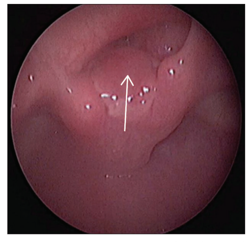
Figure 2: Bronchoscopic image of the laryngeal mass in our patient (shown by arrow).

Two weeks later, the patient was brought to the Emergency room, with severe stridor. Emergency tracheostomy under general anesthesia with IV midazolam, ketamine, and